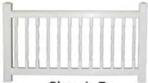
Olympia T Picket Spacing - 3 3/8"