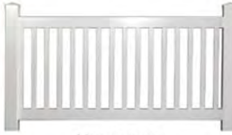
Hampton Picket Spacing - 2 1/2"