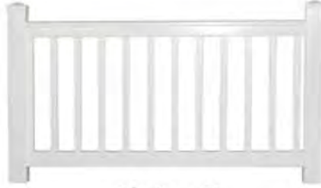
Alpine T Picket Spacing - 3 7/8"