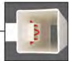
The patented Rail-Lock connection system which enhances the strength and security of your fence structure, is an option available for an additional charge.