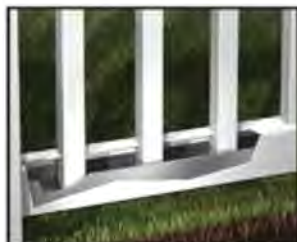
Rail reinforcement for added strength.