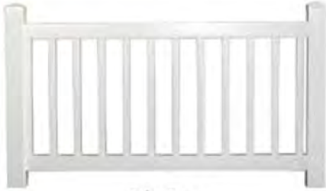
Alpine Picket Spacing - 3 7/8"