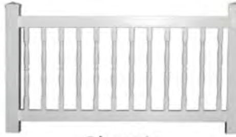
Olympia Picket Spacing - 3 3/8"