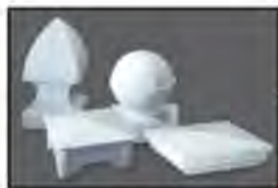
Elegant post caps and custom details add the perfect finishing touch.

All of Durations Vinyl Fencing materials are made here in the U.S.A. We employ only U.S. citizens in all of our manufacturing and distribution locations.