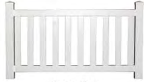
Camelot Picket Spacing - 3 1/2"