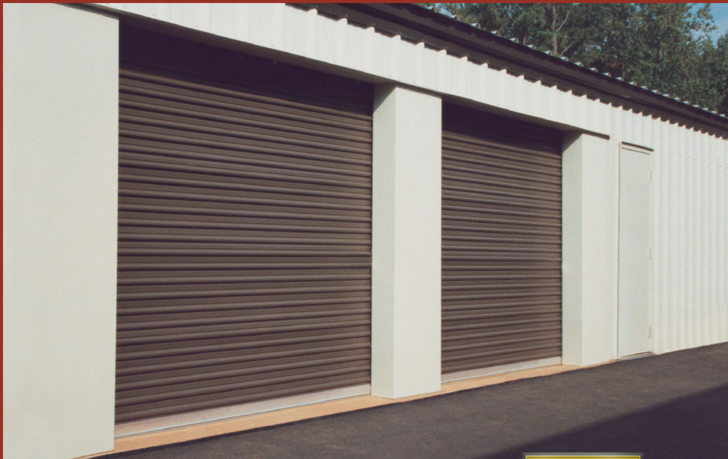
Light Commercial DS-100 Roll-Up Steel Doors