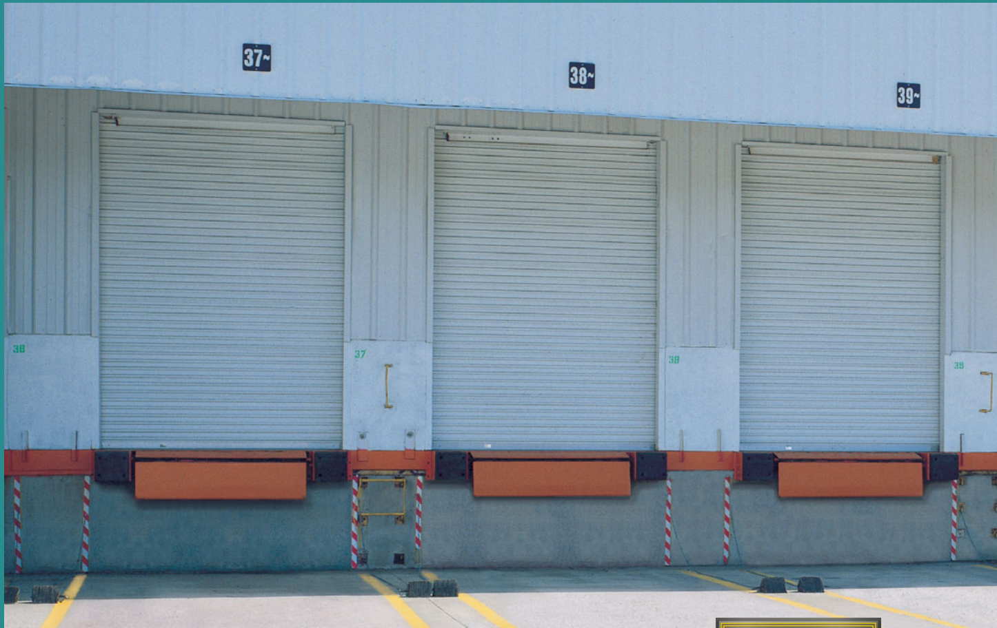
Commercial DS-200 Roll-Up Steel Doors