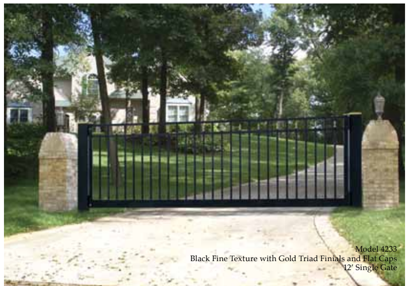
Model 4233 Black Fine Texture with Gold Triad Finials and Flat Caps 12' Single Gate