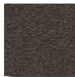
DSI 107 Metallic Bronze Fine Texture