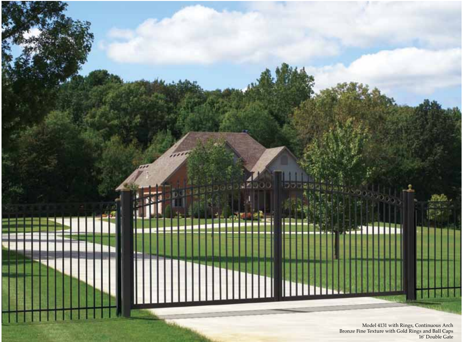
Model 4131 with Rings, Continuous Arch Bronze Fine Texture with Gold Rings and Ball Caps 16' Double Gate